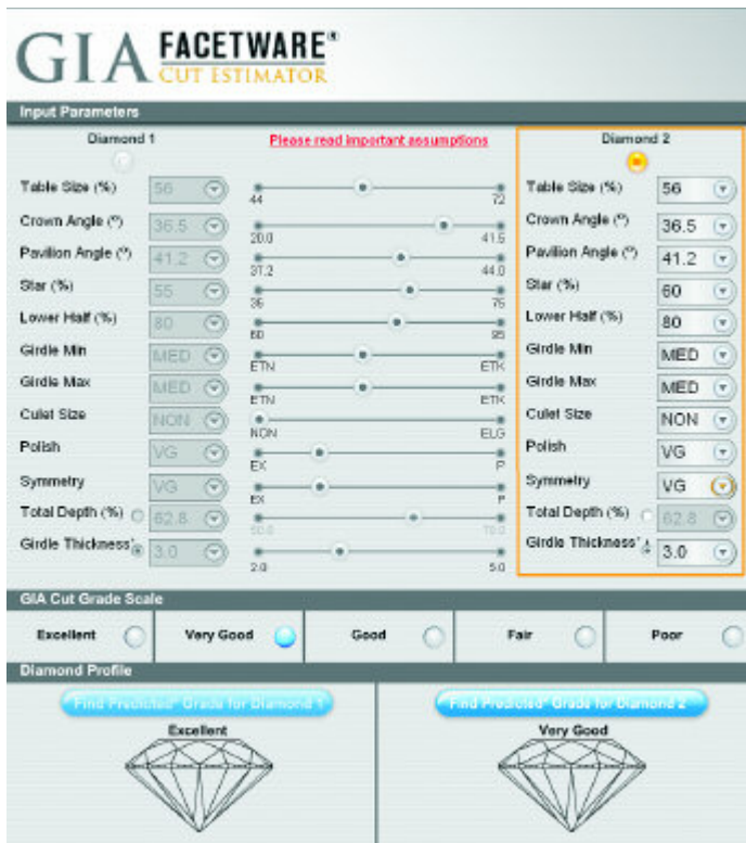
Figure 1. Changing the star length value from 55% to 60% changes the estimated cut grade from Excellent to Very Good.

changes the estimated cut grade from Excellent to Very Good. Appearance is the key cut grade aspect for this case because longer stars combined with the other proportions negatively affect the face-up appeal. Another common situation is shown in figure 2, where changing the girdle thickness from 3.0% (diamond 1, left) to 3.5% (diamond 2, right), with all other proportions remaining identical, changes the grade to Very Good. In this case, design is the key cut grade aspect because these proportions combined with a thicker girdle create a weight ratio value that exceeds the threshold for Excellent. (See “A Foundation for Grading the Overall Cut Quality of Round Brilliant Cut Diamonds” at http://www.gia.edu/diamondcut/pdf/cut_fall2004.pdf )